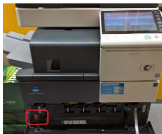
Power button behind front door #2 – below toner door

After power outlet in order to get correct network connection.